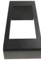
Single Desk Stand