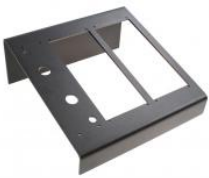
Triple Desk Stand