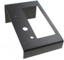
Dual Desk Stand